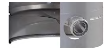
Lateral bottom outlet