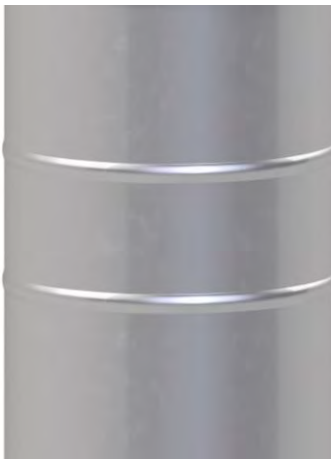
Ultra Clean - beads