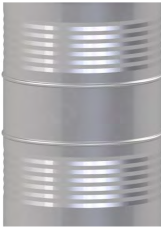
Retaining and side beads