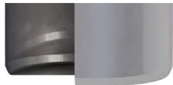
Stackable flat bottom