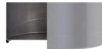
Flat bottom with base ring