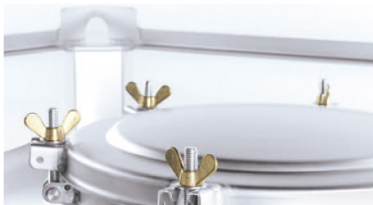
Top cover according to dn 400 and compliant with food and pharmaceutical industry. Clamping ring cover dn 400 with hinge.